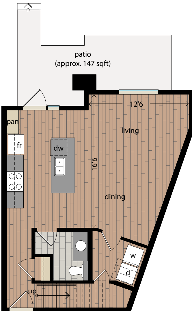
MAIN FLOOR: 548 SQFT