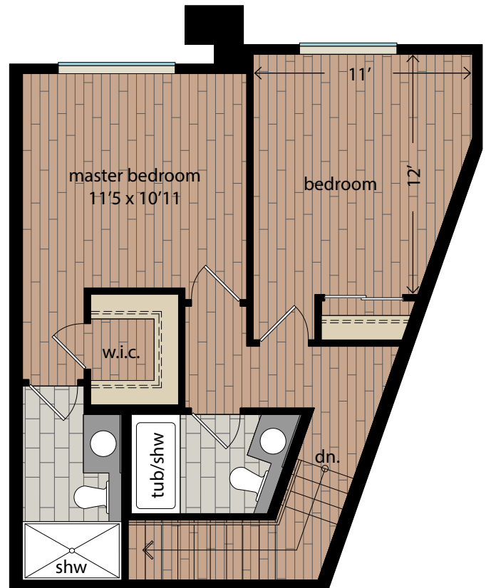
UPPER FLOOR: 558 SQFT